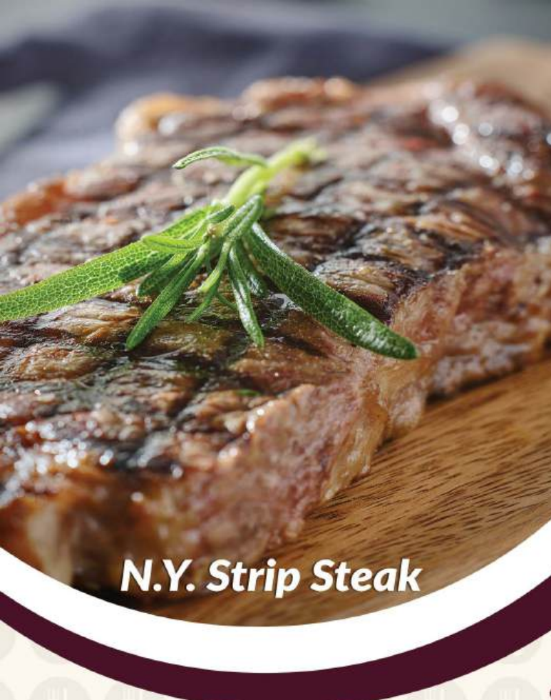
N.Y. Strip Steak