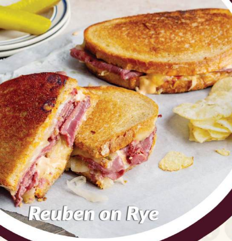
Reuben on Rye