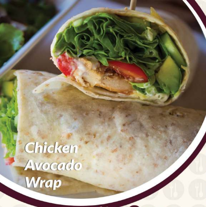
Chicken Avocado Wrap